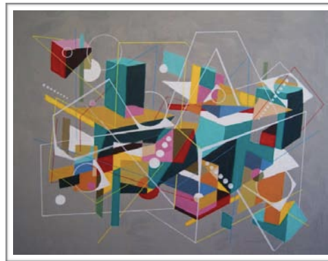
Playground 2016 Acrylic on Board 24" x 30" $1000