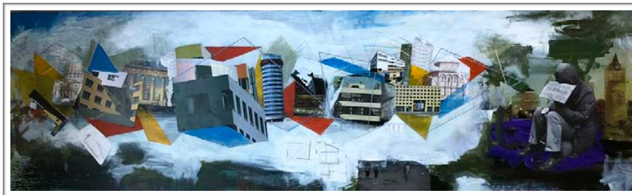
Gentrification 2018 Mixed Media 16" x 54" $800