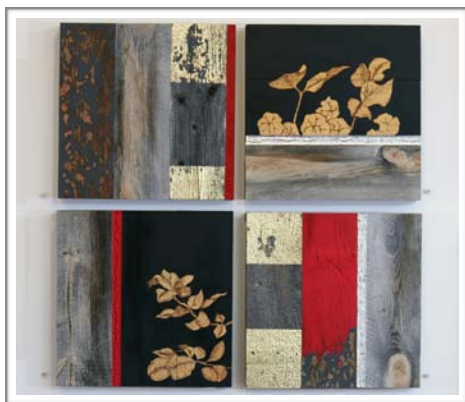
Brots #1 - #4

This work series entitled “ Brots ” which in my native language, Catalan, means “Buds” represent the contrast between the city trees’ germination and growth and, at the same time, them being used as construction materials for the city’s growth itself. Using pyrography (wood burning) to represent the trees and foliage, and wood panels and cracked plaster details as the contrasting construction elements.” – Samanta Tello, 2018.