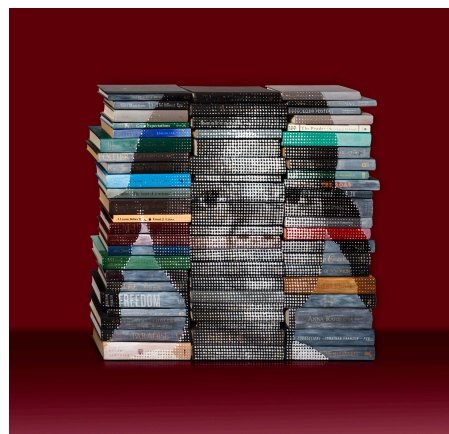
Brett Kaufman Little Girl O 2015 assemblage

Avenue 12 Gallery is a contemporary art gallery in San Francisco with a focus on artwork by emerging and established Bay Area artists.